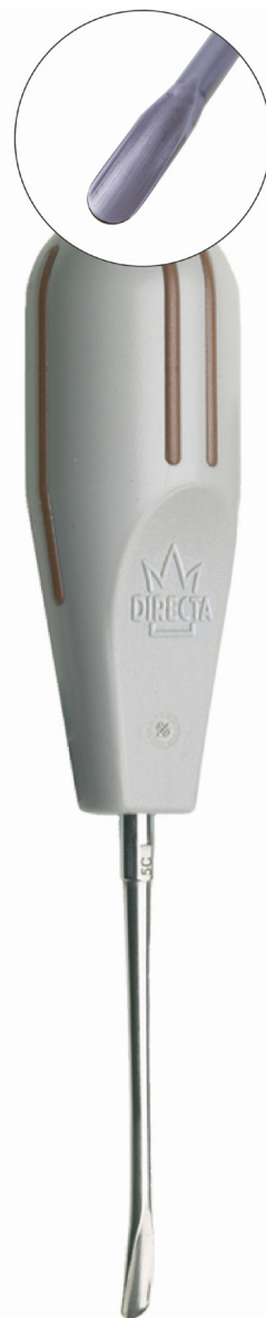
L5C Periotome 5 mm Curved Standard