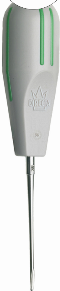
L2S Periotome 2 mm Straight Standard