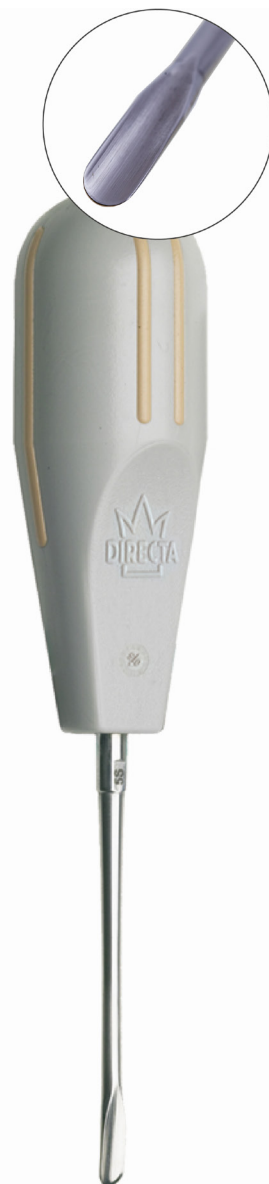
L5S Periotome 5 mm Straight Standard