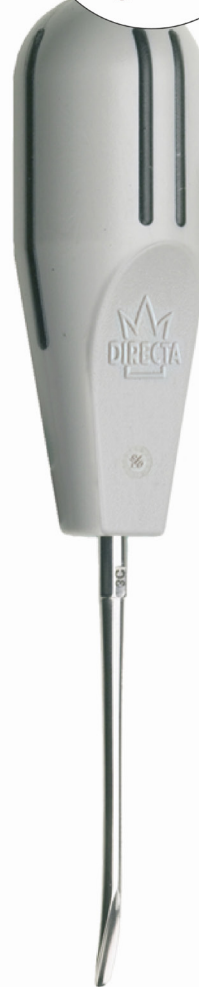
L3C Periotome 3 mm Curved Standard